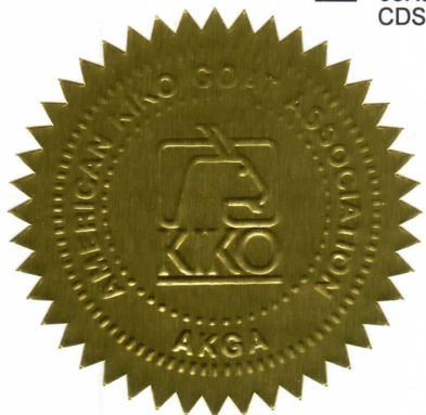
Registered Seal American Kiko Goat Association